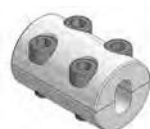
Device for manual crimping