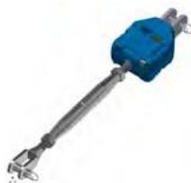
Tensor + Pre-adjustor