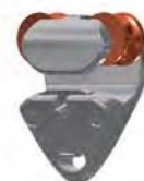
Stainless steel shuttle